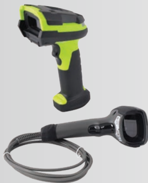
Bar Code Scanners