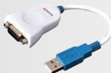
USB to RS-232 Serial Adapter