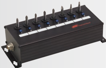
Bit Selector Tray