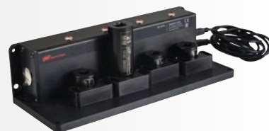
Socket Selector Tray