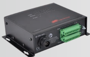
8 x 8 24 VDC USB DIO Box