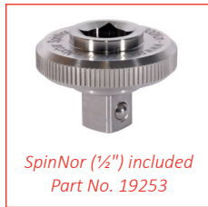
SpinNor (1/2") included Part No. 19253