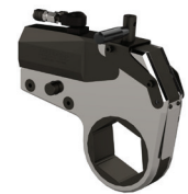
Handle kits for TWH430N