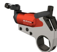
Handle kits for TWH27N, TWH54N, TWH120N & TWH210N