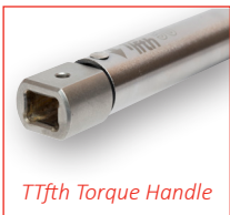
TTfth Torque Handle