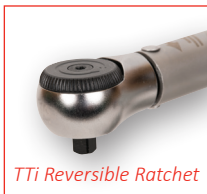
TTi Reversible Ratchet